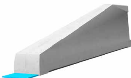
Terminal element REBLOC 80S_4T_S37 (inclination 1:5)